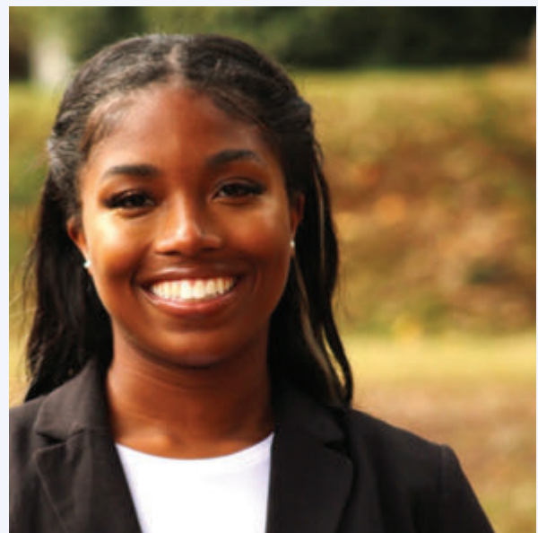
Nya Morgan International Studies